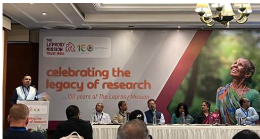
Panel discussion on current state of research