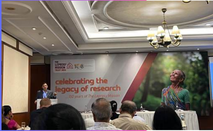
President International Leprosy Assn, USA